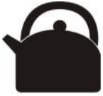
Stainless steel pot